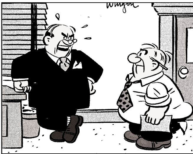
"I took your request for a raise to the manager, and it almost cost me my job!"