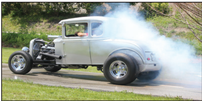
Car Show & Burn-Out – Page 2