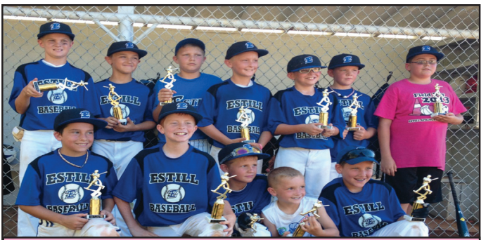
All Stars – Page 15