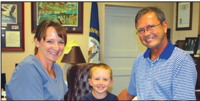
Animal Shelter Receives Donation – Page 15