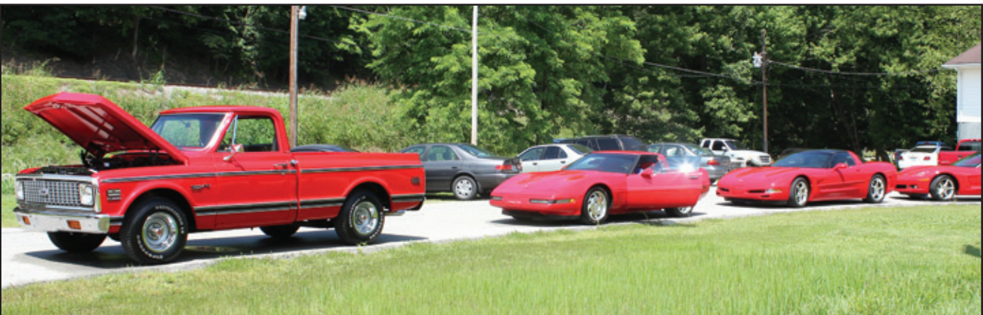
Red was a popular color for cars and trucks at the American Legion Car Show on Saturday. Car owners were challenged by the rain which stopped about the time the trophies were presented.