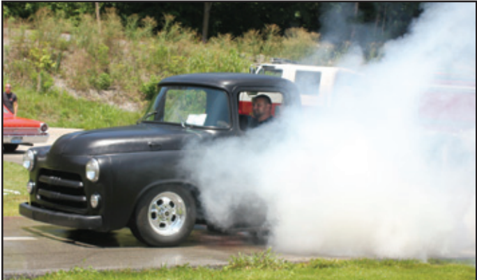
An antique truck showed it could still compete with the best in the burn-off.