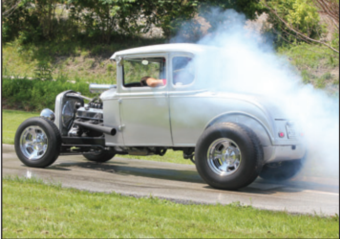
Another antique successfully competed in the burn-out.