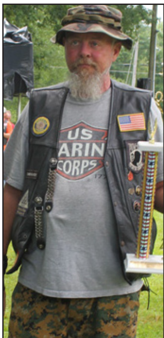
A winner in the motorcycle division of Post 79's car and bike show on Saturday. It was followed by a burn-out.