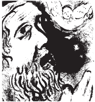
Detail of Job Praying by Marc Chagall, 1960

© 2013 by King Features Syndicate, Inc. World rights reserved.