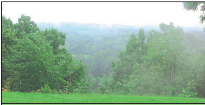
A foggy Estill County August morning