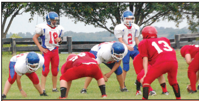
Patriots Scrimmage Bath - Page 15