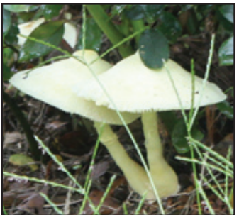
All the rain has brought out fungi and mushrooms in all colors and shapes this summer.

Anyone with information on any of these tools is asked to call the sheriff's office at 723-2323 during business hours or 723-2201 after hours.