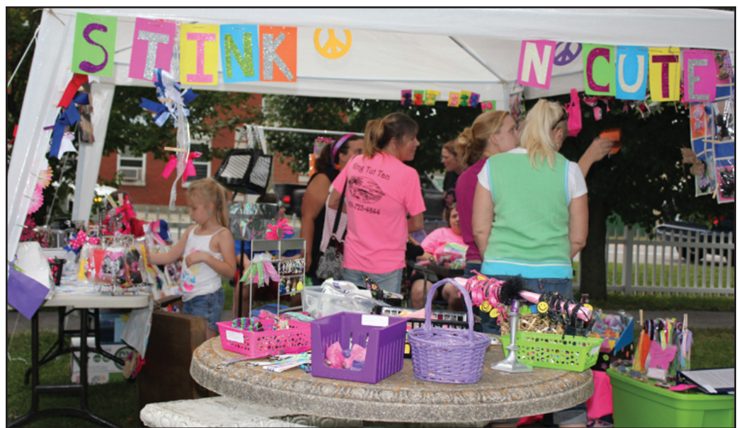
The City of Ravenna hosted a free crafts fair at Veterans Memorial Park during Revive Ravenna Drive. Several craftsmen set up although there was a threat of rain, including Stink 'N Cute, pictured above.