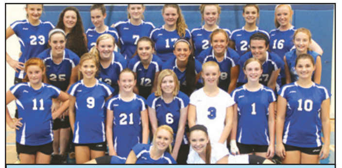
Lady Engineers Volleyball – Page 15