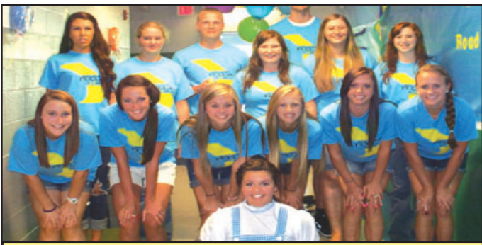
FCCLA Welcomes Students – Page 15