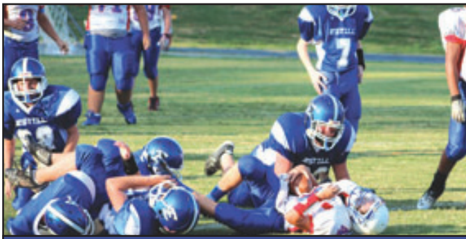
Patriots Back in Action – Page 14