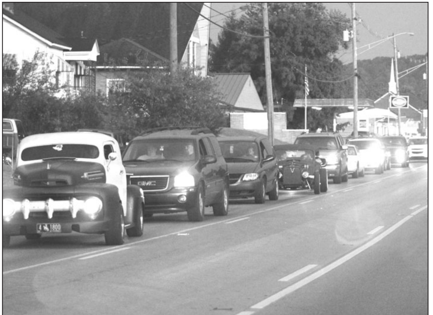
The second annual Revive River Drive was held on Saturday, August 31st. Traffic was bumper to bumper on River Drive as people came out to cruise the strip and socialize with friends.