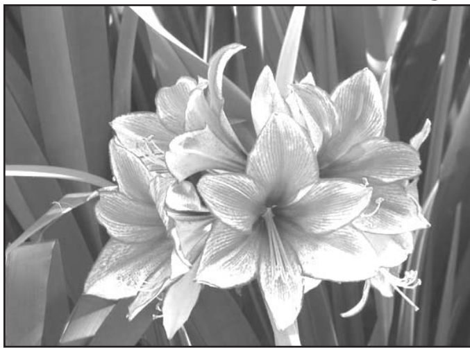
Freshly picked amaryllis

When you buy an amaryllis, it likely will be a dormant bulb. If so, pot the bulb about 6 to 12 weeks before you want the plant to bloom. Use a container with a diameter just slightly larger than the bulb and a potting mix that promotes good drainage. One-third to one-half the pointed end of the bulb