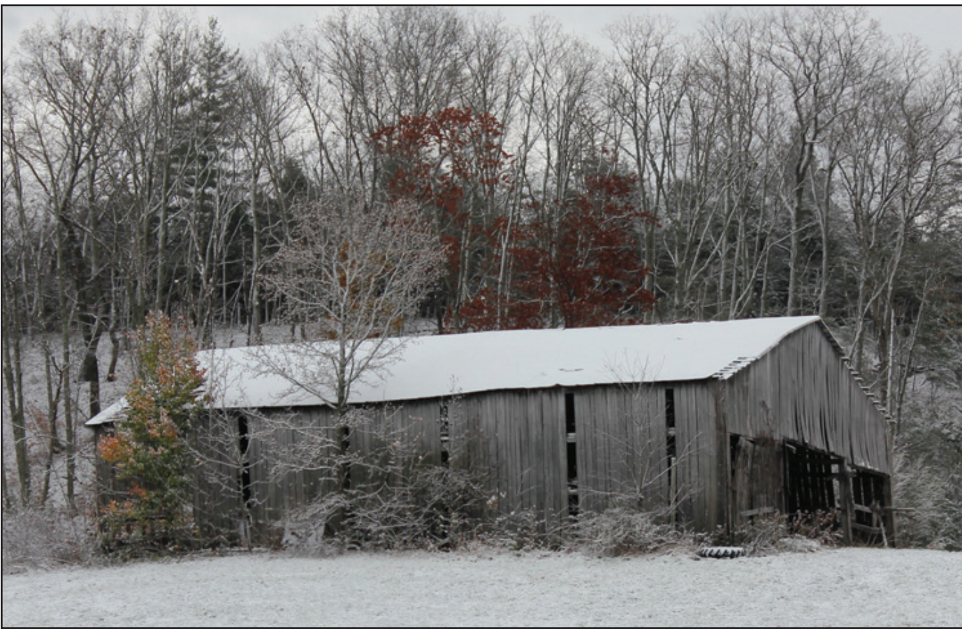
Snow covered everything in Estill County on Monday. Above is a barn which was once used to house tobacco. Few barns in the county are now used for housing tobacco, but there are still a few tobacco growers around. Their goal is to get it stripped before the snow starts flying and freezing temperatures arrive.