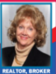
REALTOR, BROKER CRS, GRI, ABR

Email <jmarcum@aol.com> or Visit us at www.joycemarcum.com