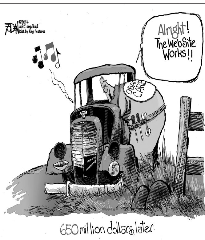
650 million dollars later.

IPD Officer Rifenbark conducted the investigation.