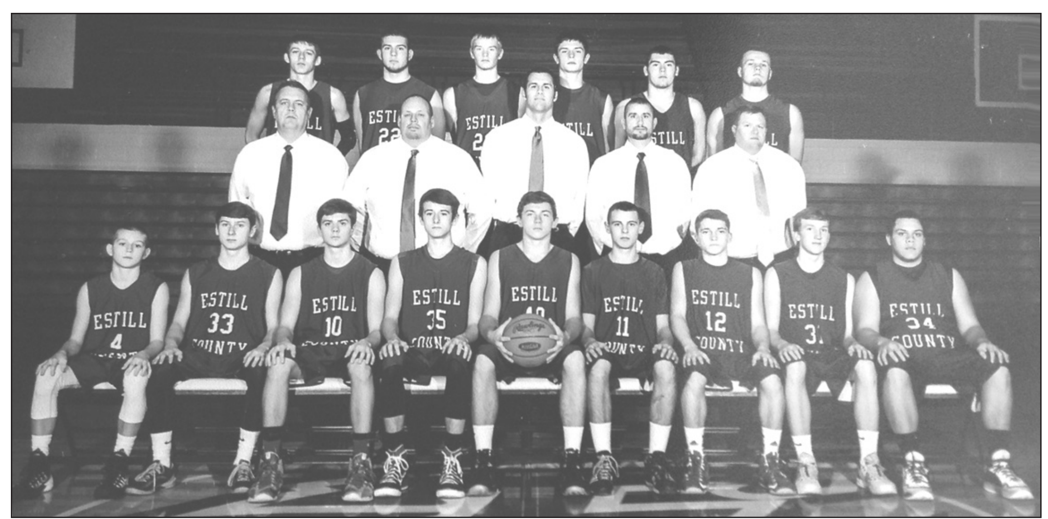
The 2014-15 Estill County Engineers -- Regular Season District Winner