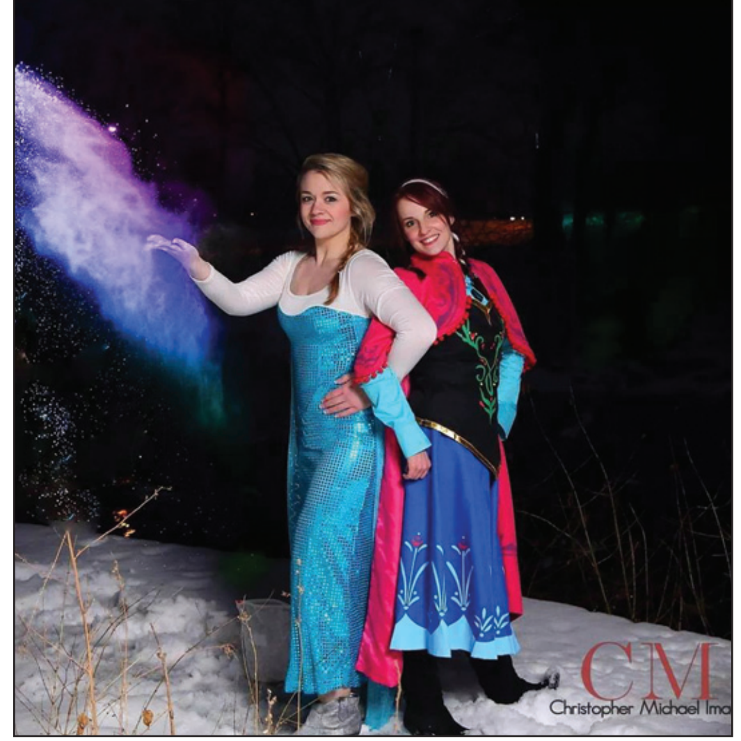
Frosted Over, a benefit for Relay for Life will be held March 21st from 2-5 at Estill Springs Elementary cafeteria. The Ice Queen and Snow Princess will be there. For a $5 minimum donation to the Relay for Life, parents can bring their child to meet us and have photo opportunities.

$5 minimum donation per child to attend All donations go directly to the Relay For Life and their commitment to help people get well, stay well, find cures, and fight back against cancer.