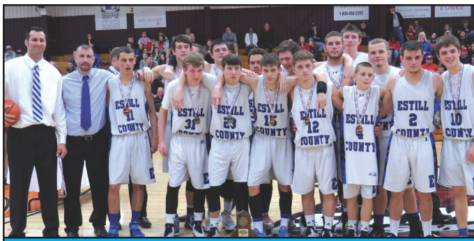
Engineers District Champs - Page 14