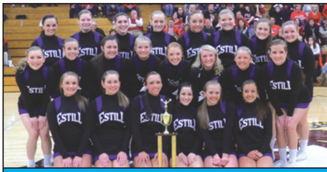
Cheerleaders Win District - Page 15