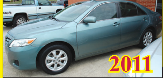
2011 TOYOTA CAMRY AUTO, LOADED! ONLY 24,000 MILES! WE FINANCE! STOP & SEE THIS ONE!