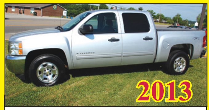
013 CHEVROLET SILVERADO 4X4 CREW CAB! WELL EQUIPPED! STOP BY AND TEST DRIVE THIS TRUCK-CAR COMBINATION!

2013 TOWN & COUNTRY VAN 7-PASSENGER CHRYSLER VAN! DVD! LEATHER! WELL EQUIPPED! PERFECT FAMILY CAR! GOOD MILES!