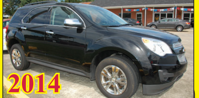
2014 CHEVROLET EQUINOX 4X4, LOADED, LOW MILES! FACTORY WARRANTY! ALL TYPES FINANCING AVAILABLE

We need your late model trade-ins! Beware of Salvage or Rebuilt Titles! Require a