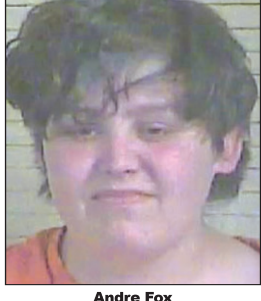
Andre Fox Photo/Three Forks Jail