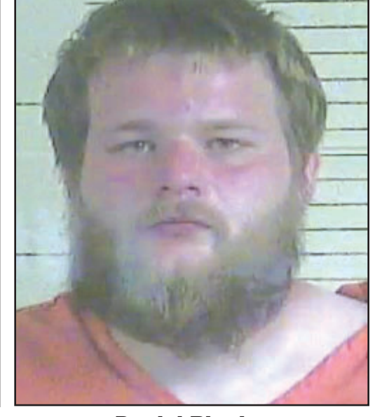
Daniel Rhodus Photo/Three Forks Jail