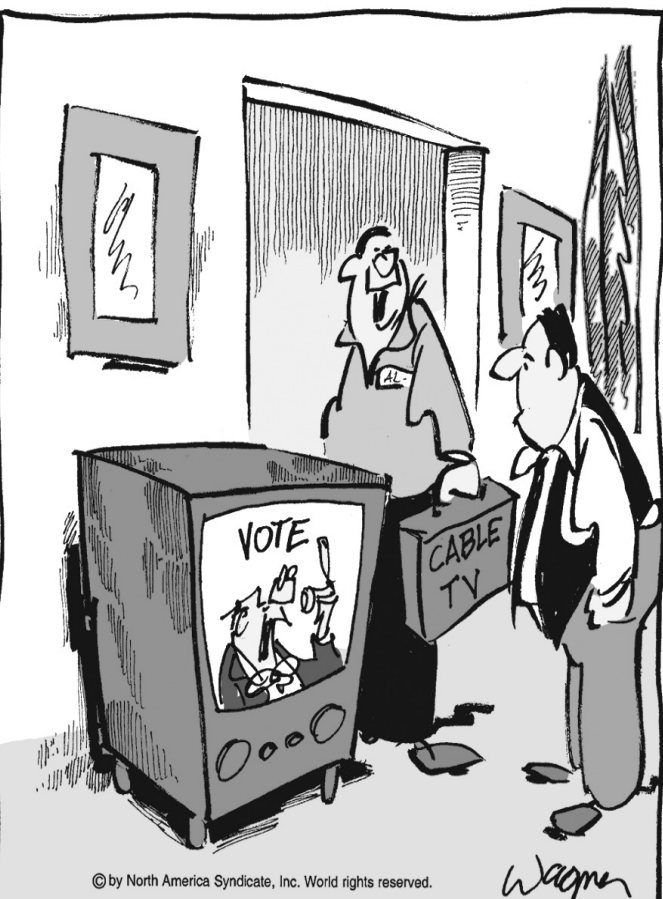
"There! You now get 120 channels of that!"