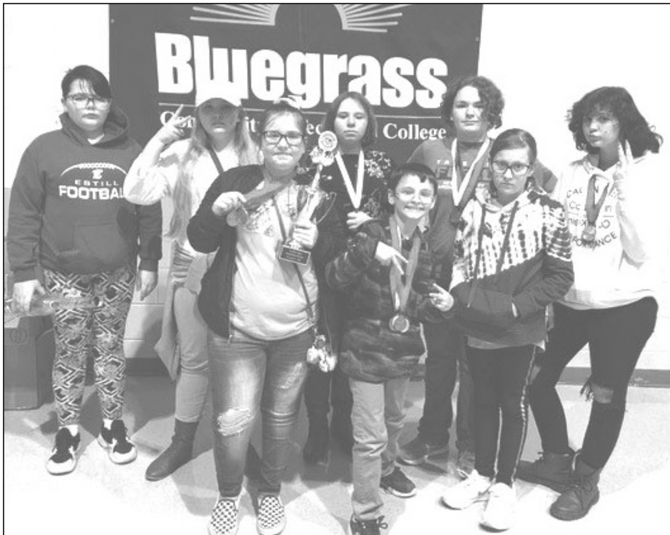
AT LEFT: The Estill County Middle School Science Olympiad team recently competed in 23 Science, Technology, Engineering, and Mathematics (STEM) related events at Bluegrass Community and Technical College. The team had eight students to compete and as a team they placed second in the Lexington Regional Science Olympiad Tournament. The team qualified for the state tournament scheduled for April 18 at the University of Kentucky.