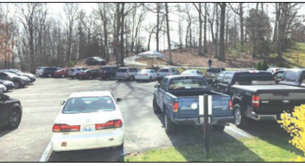
ter is closed to its usual clients. Staff at Estill County churches have been forced to cancel their regular services during the pandemic. Some of them used Facebook Live with the minister delivering a morning message. Salem Baptist Church held a drive through service in the church parking lot. (pictured above).