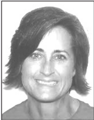
by Dawn Reed E. Ky. Columnist

What are you wearing these days? Are you in a