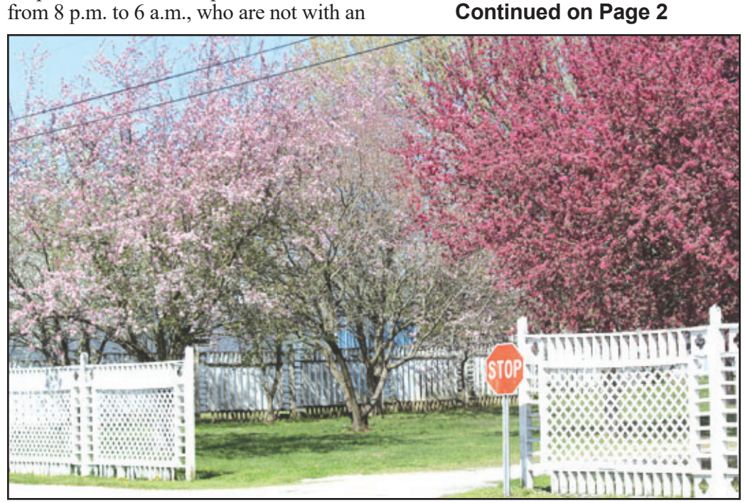
Flowering crab apple and at least two other varieties of trees bloomed beautifully in a lot across from Irvine City Hall.

Parents of juveniles under 18 will be cited.