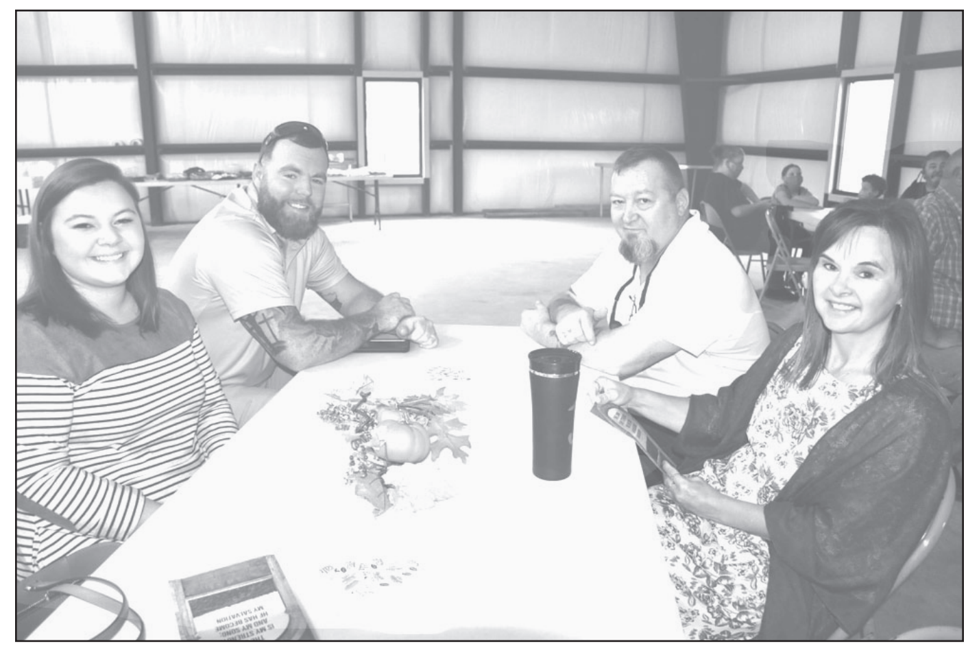
Everyone practiced "social distancing" during Providence Baptist Church's Old Fashion Homecoming Day with families sitting together at tables spaced apart