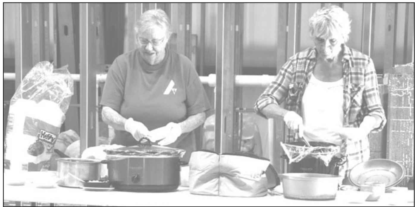
The ladies of the church served up the food at Providence Baptist's Homecoming Day.