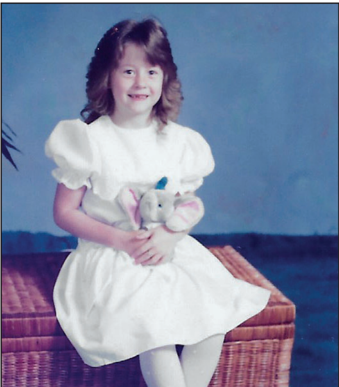
Lordy, Lordy, Look Who's 40+1 We love you, Happy Birthday! God Bless You! from The 2 P's & Family