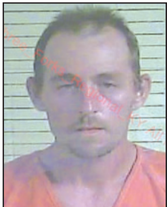
Anthony Brooks Photo/3 Forks Jail