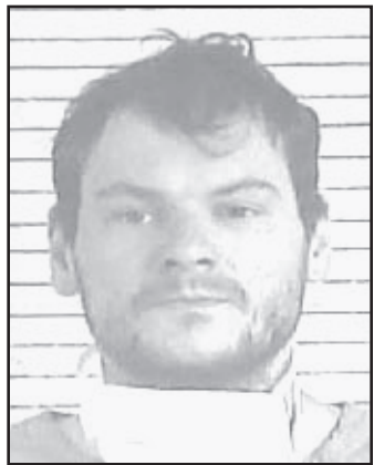
3 Forks Jail