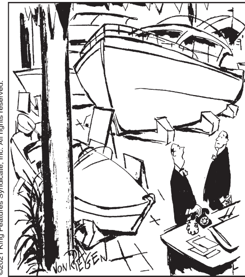
"Thomas won't be in today — he's _____."