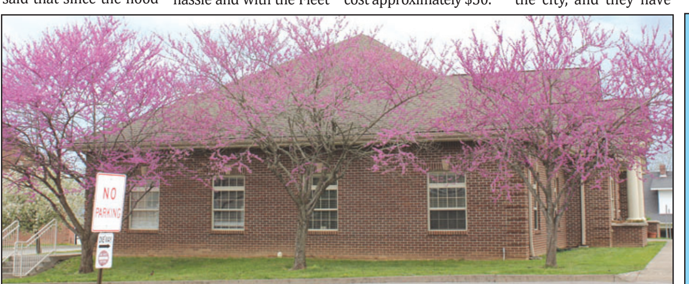
Redbud trees in the landscape on a side of Irvine City Hall burst into bloom in the last week.

Call (606) 723-5012 • Visit <www. EstillTribune. Com> • Email <News@EstillTribune. Com>