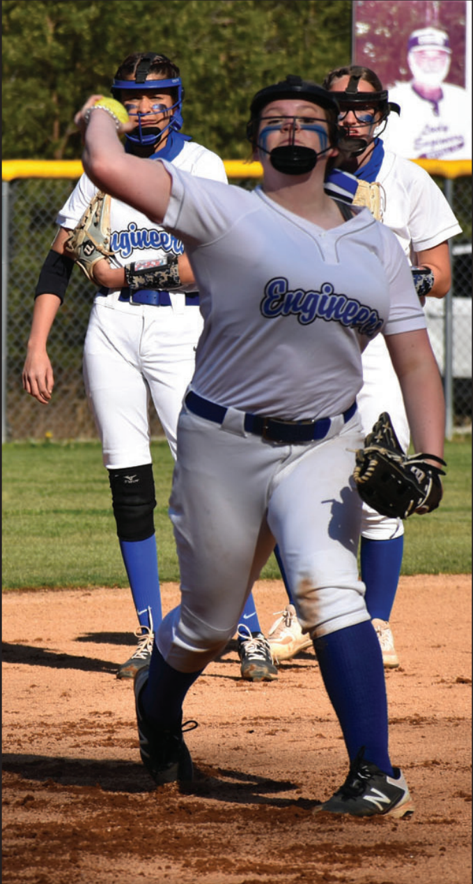
Lady Engineers get some pre-game warmups