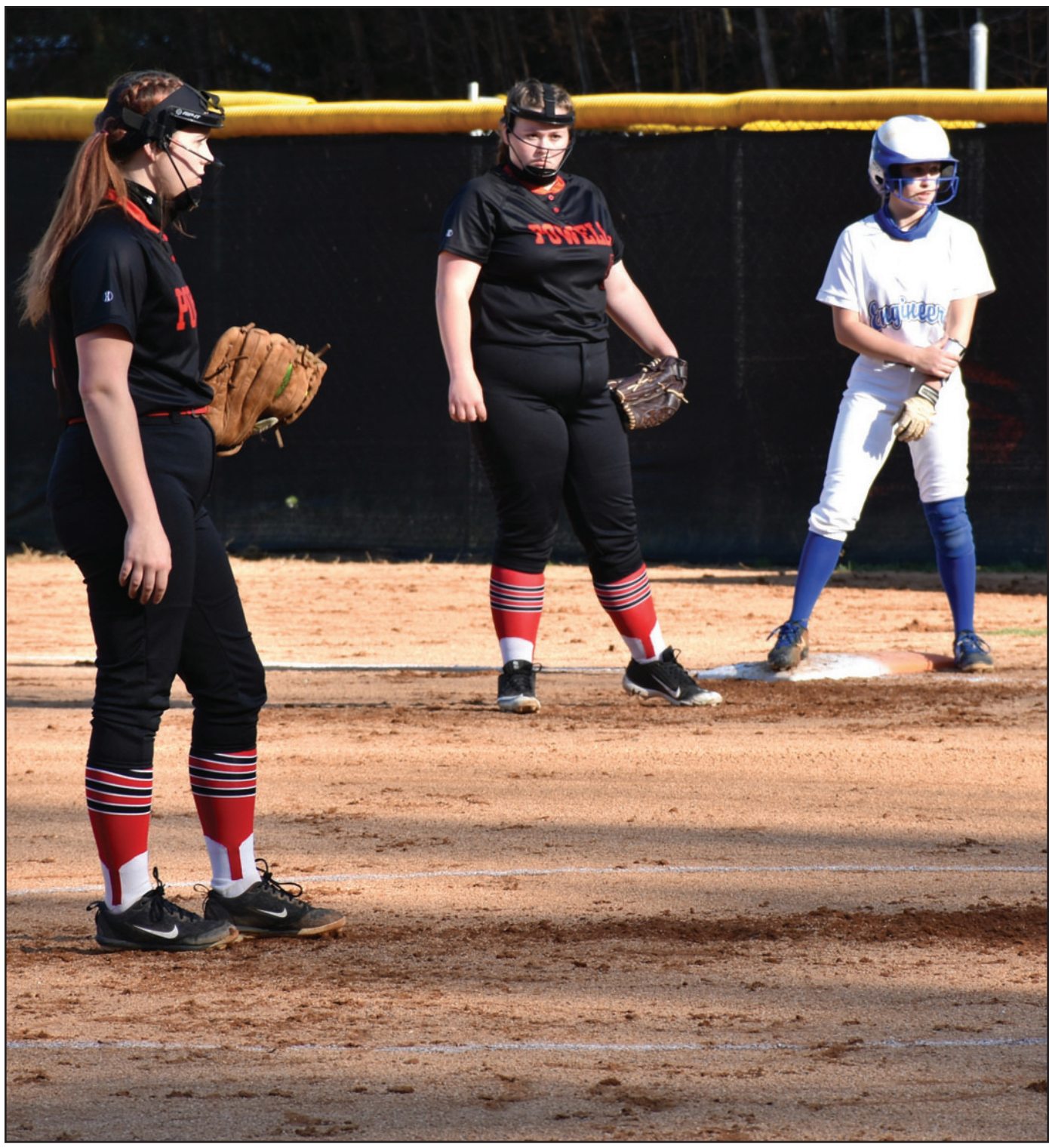
The Powell Lady Pirates (black) look for a way to stop the Estill Lady Engineers with one player on base.