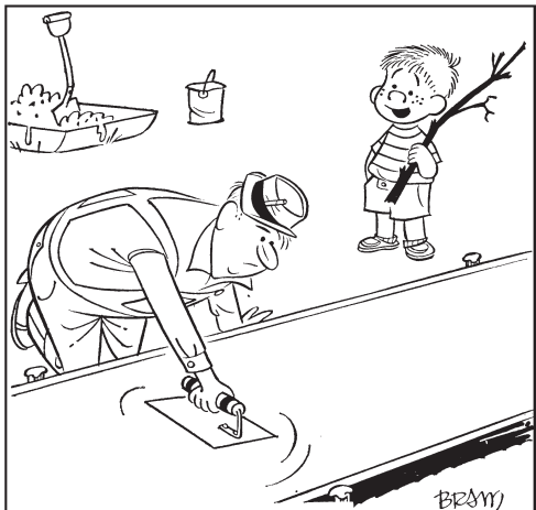
"When's _____ time?"