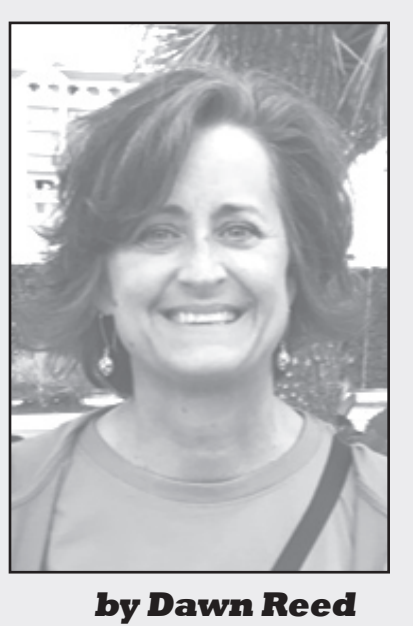
Eastern Ky. Columnist

Sometimes it seems like winter is lasting forever. The cold seeps into our bones. We long for spring and the new life it brings! Daffodils and forsythia yell, "It's here! It's here!" but the snow doesn't listen. Christmas seems like it was so long ago! When will spring truly begin?