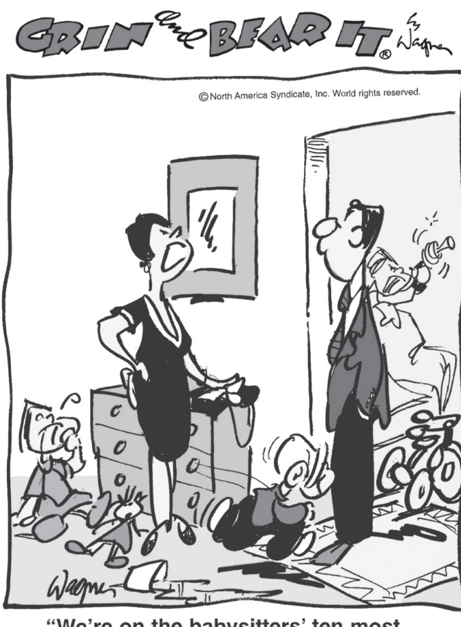
"We're on the babysitters' ten most unwanted list!"