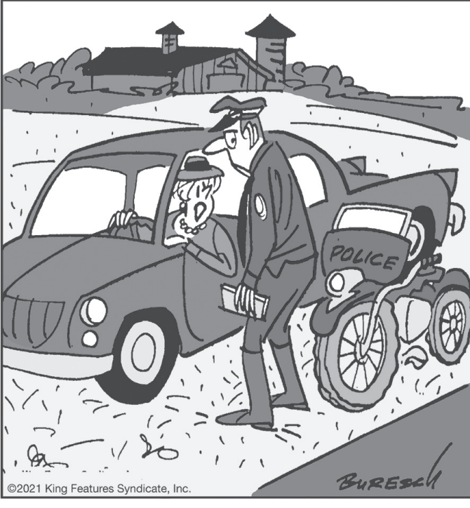
"Oh, dear! Did I miss a stop sign while admiring you in my rearview mirror?"