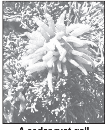
A cedar rust gall

With spring rain showers and warm weather coincide, cedar rust galls will develop on cedar and other Juniper species. As galls swell, they produce spores that threaten apple trees and sometimes crabapple and hawthorn. Galls indicate that rust pathogens are releasing or preparing to release infective spores.