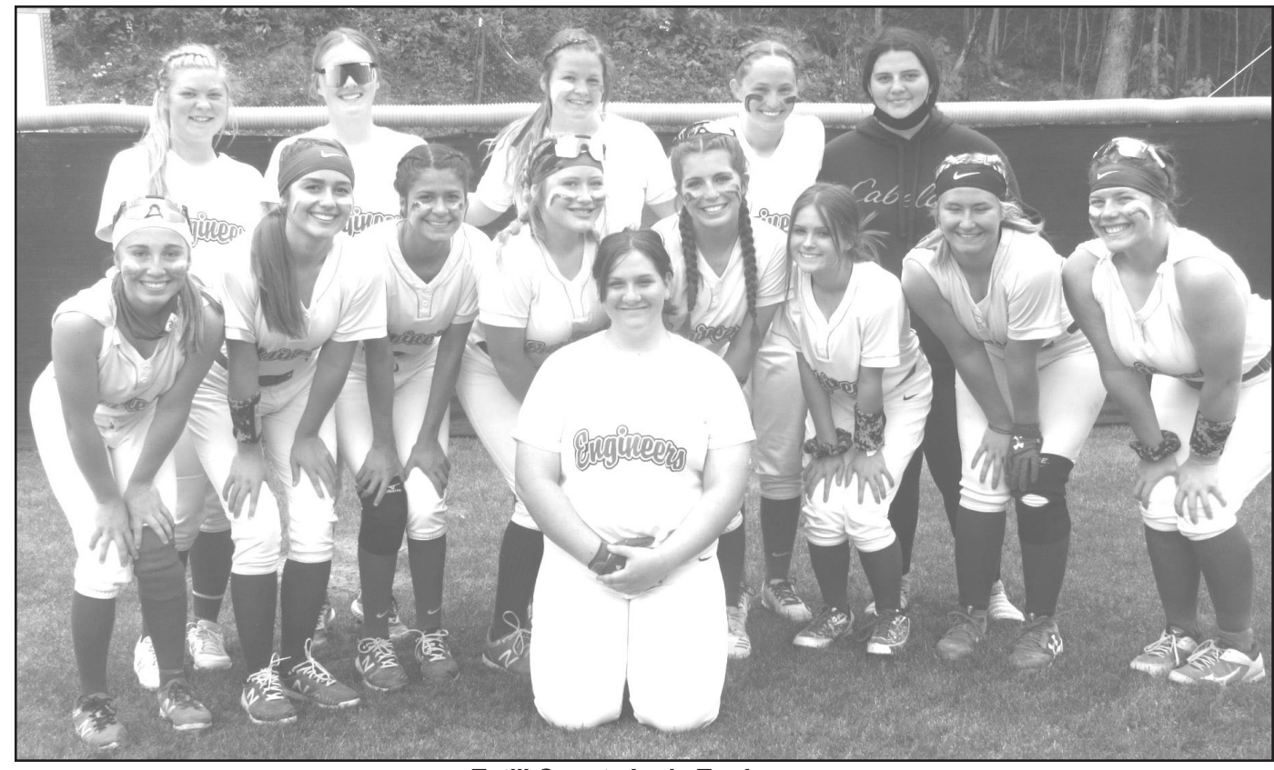
Estill County Lady Engineers