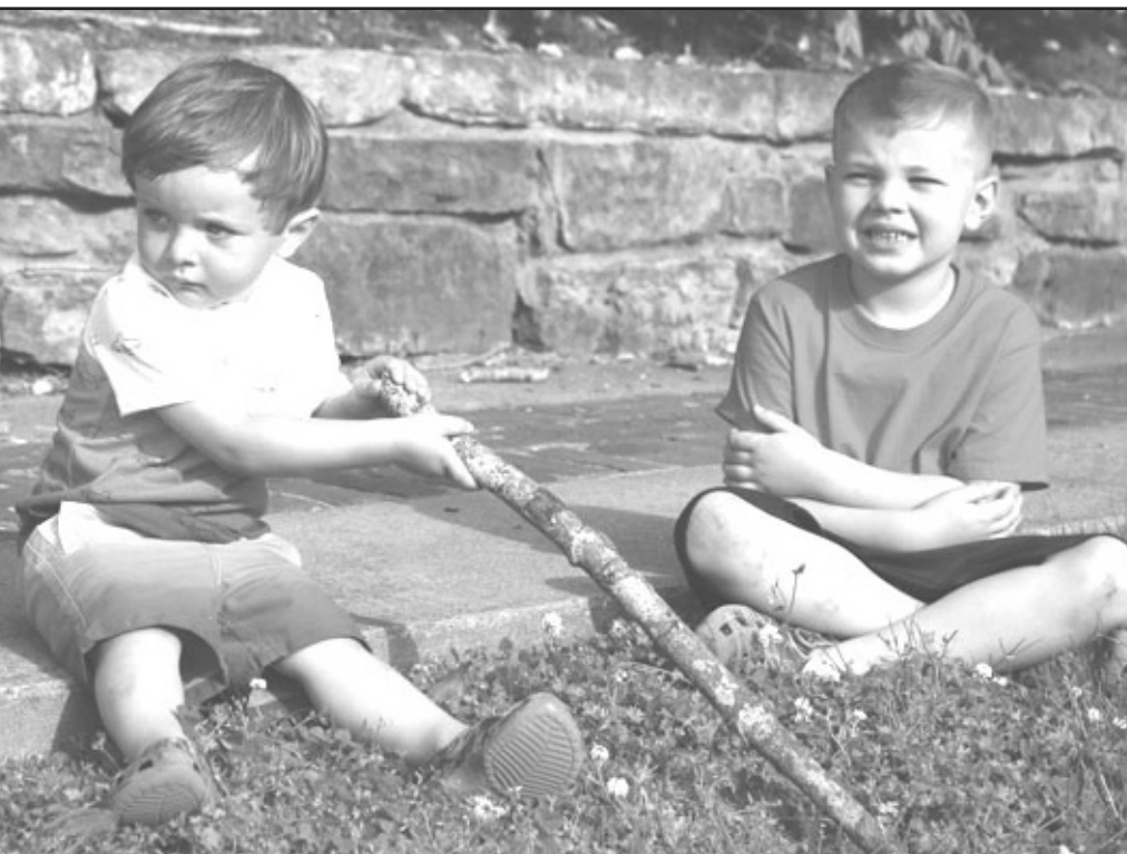
Cousins enjoyed the Prom parade on Main Street on Saturday evening. This was the first known parade before a prom, but it was similar to last year's parade for the graduates.