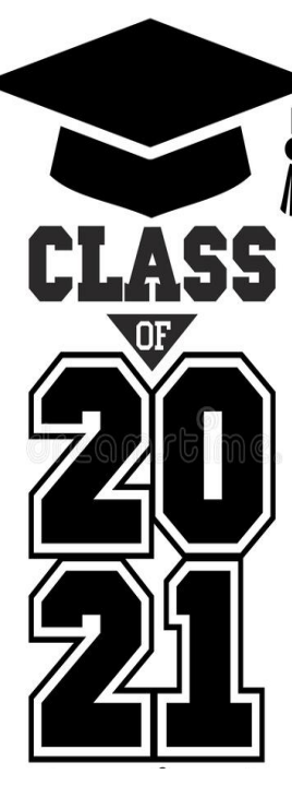
Estill County High School