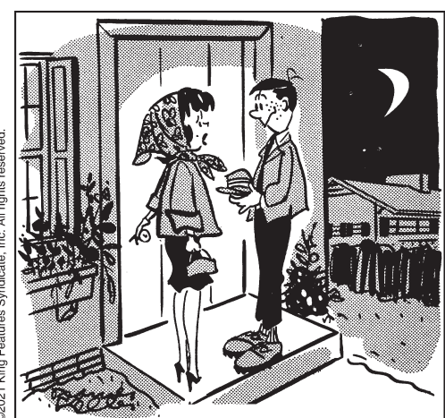
"It was a very educational evening, Stanley. I certainly learned a lot about _____!"