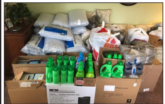
Partial results of the first day of shopping.