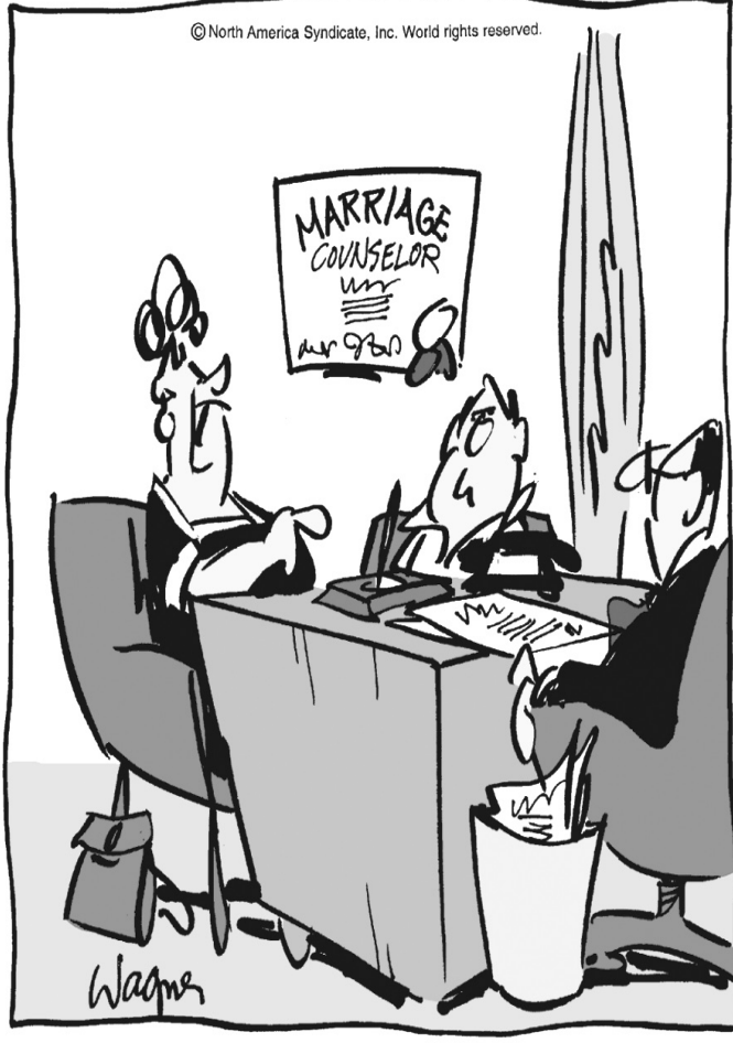
"I'm tired of keeping myself beautiful for him!"