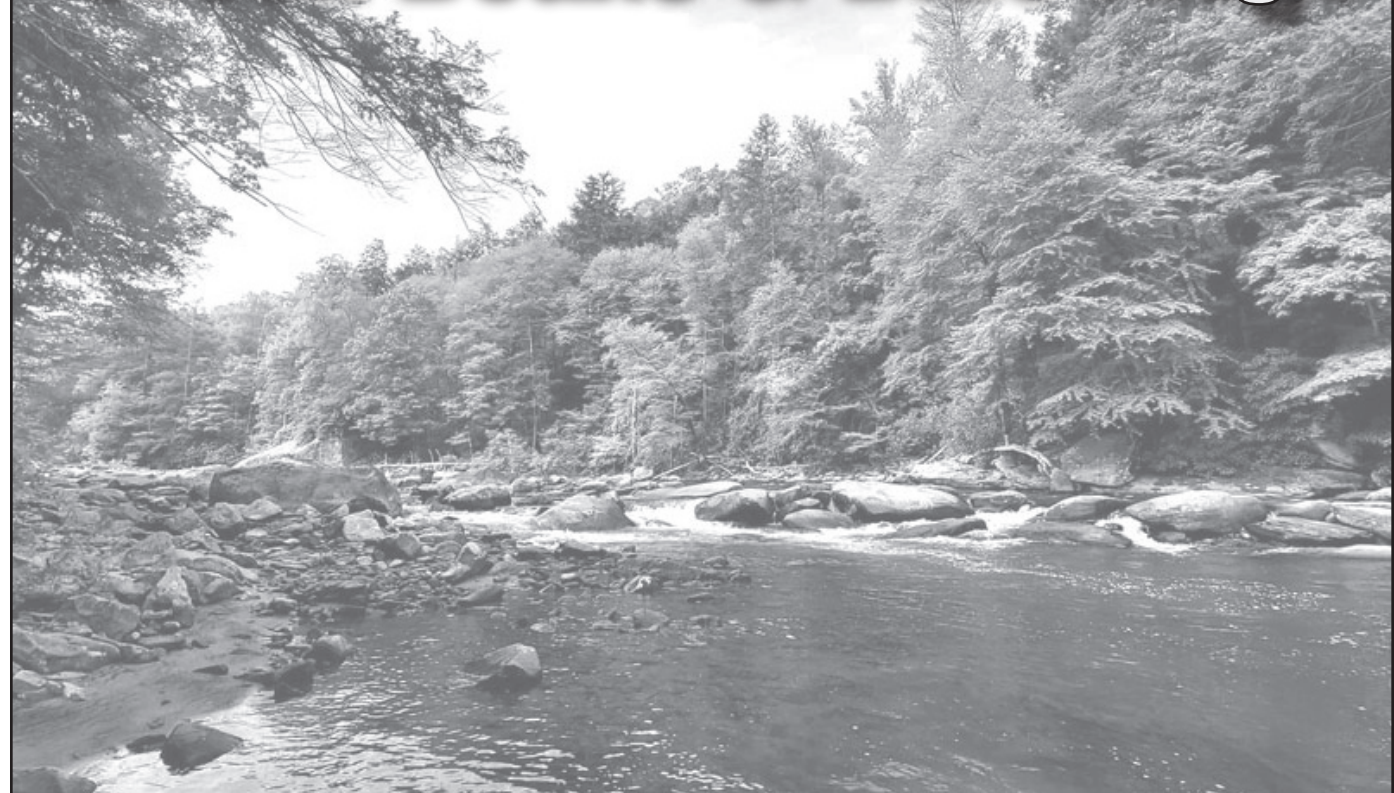
A Blue Ridge Mountains stream.