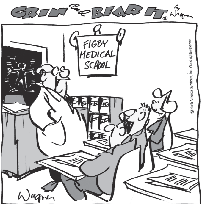
"In three years you'll be opening offices, so start saving your magazines."