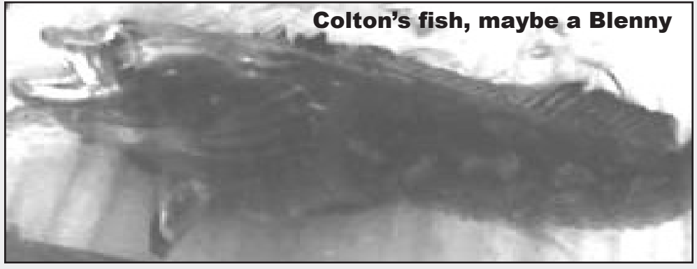
Colton's fish, maybe a Blenny

My Grandpa and I liked to fish on the Kentucky River with cane poles, nothing fancy, earth worms, just a large spool of black fishing line and some hooks. I think the whole thing might have cost a dollar or two. My cane pole is just as good as the expensive equip-