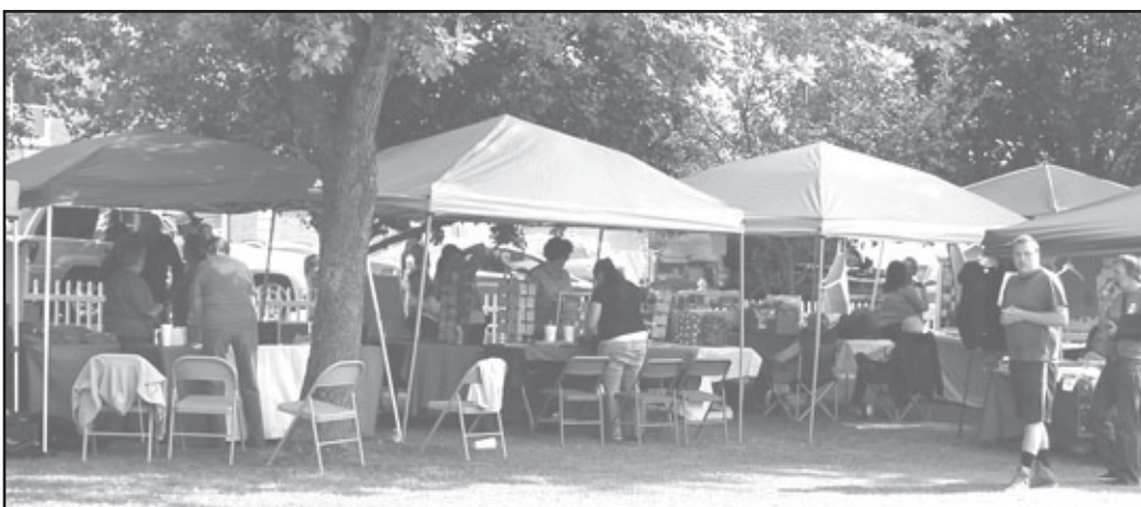
Bottom: Some of the vendors at this year's Ravenna Railroad Festival.