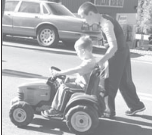
Left and above: Ravenna Railroad Festival parade pictures