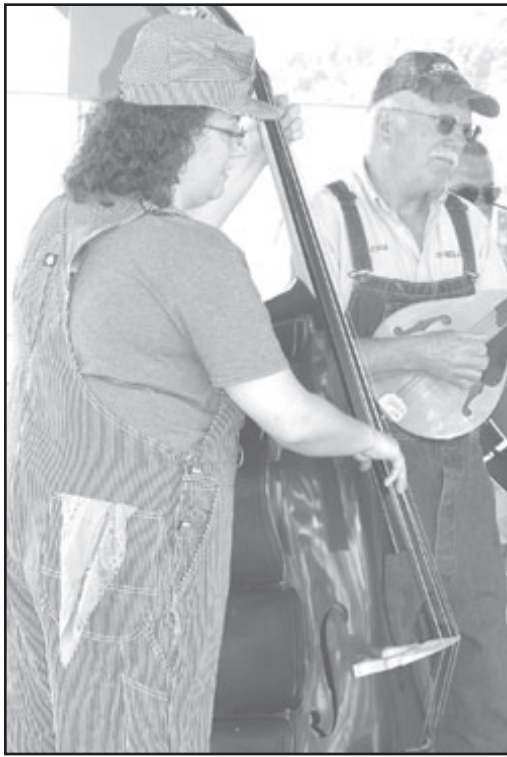
The Hilltoppers performed Saturday morning at the Railroad Festival. The group dressed in railroader's attire for the festival celebrating the city's 100th birthday.