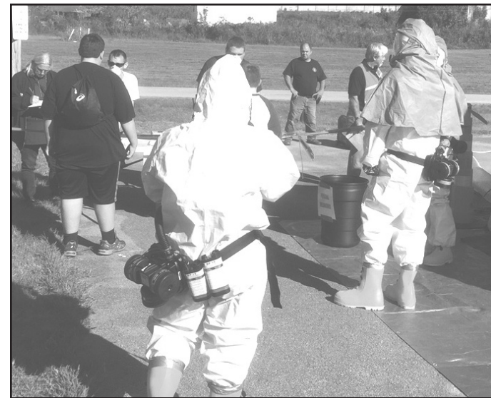
Rescue staff practice decontamination at the Estill County Fair Grounds during their annual exercise.

For More information about the CSEP Program contact the Estill County EMA/CSEPP office at 723-6533 or estillcountyma.com , find us Facebook and follow us on Twitter.