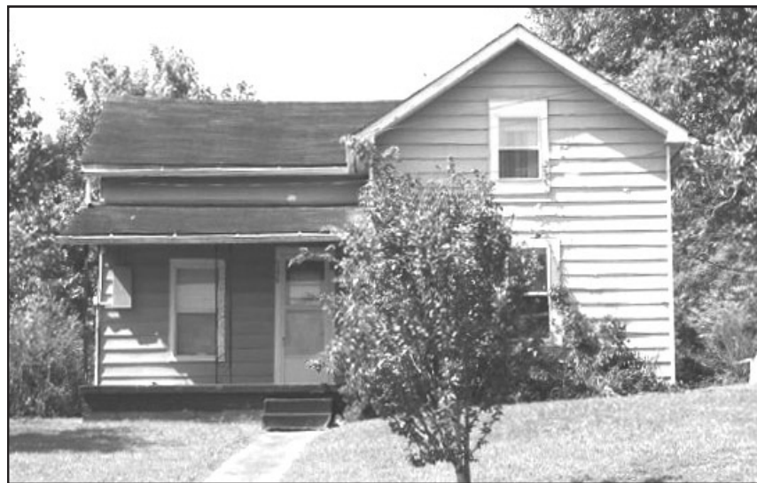
749 Cedar Grove Road, Irvine, Ky.

LOCATION: 749 Cedar Grove Road, Irvine, Ky.