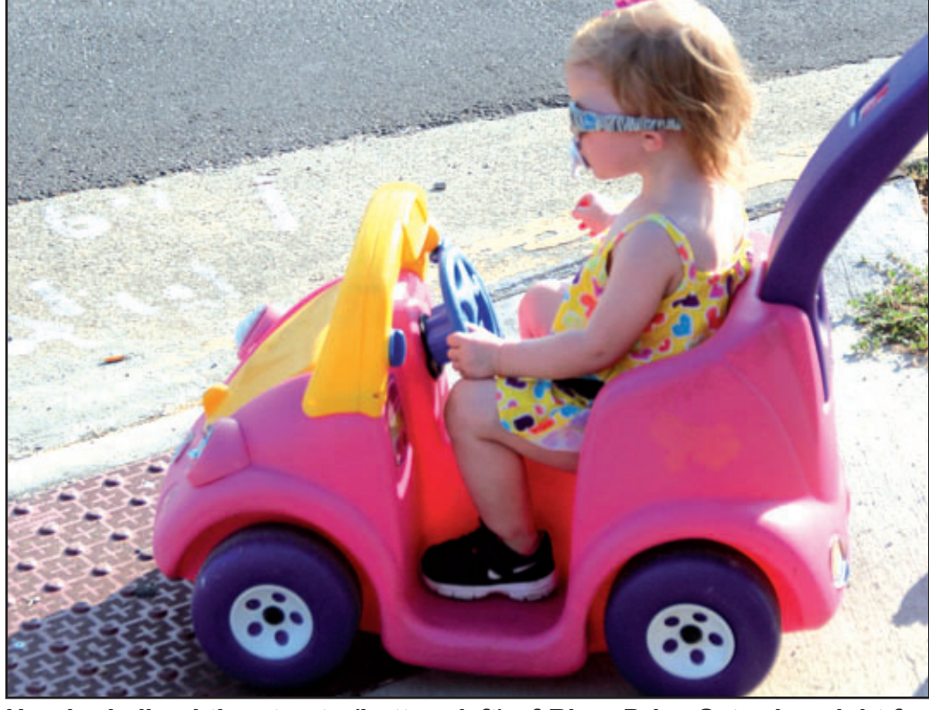
Hundreds lined the streets (bottom left) of River Drive Saturday night for live entertainment and to watch the vehicles, both antique and late model, drive by and/or burn out (top left). Ristol Sparks (above) was cruising in style during Revive River Drive on Saturday night. She is the 18 month old daughter of Ariel Sparks.