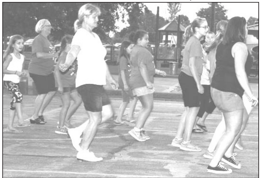
Top Photo: After the River City Players performed Friday, members of the audience joined cloggers on the basketball court to show their talents. Bottom Photo: A group of young children sang traditional songs, mostly about railroads, during their performance of "Nothing to Do in This Town."