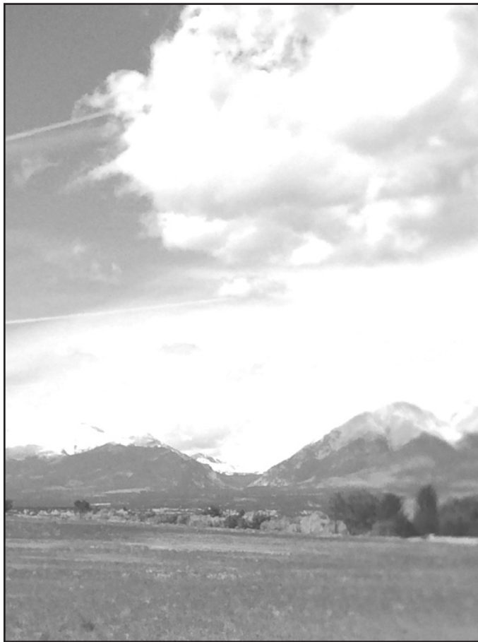
A couple of beautiful views from the Rocky Mountains of Colorado

Birding BITS BY Cindy Brook Birds That Cling Feeders are available for birds that cling, such as titmice, woodpeckers, finches, wrens, nuthatches and chickadees. The feeders are made of wire mesh and don't have perches. They come in handy because birds that can dominate a feeder, such as grackles and doves, cannot perch on them and tend to leave them alone. E-mail: birdingbits@cfl.rr.com © 2016 King Features Syndicate, Inc.