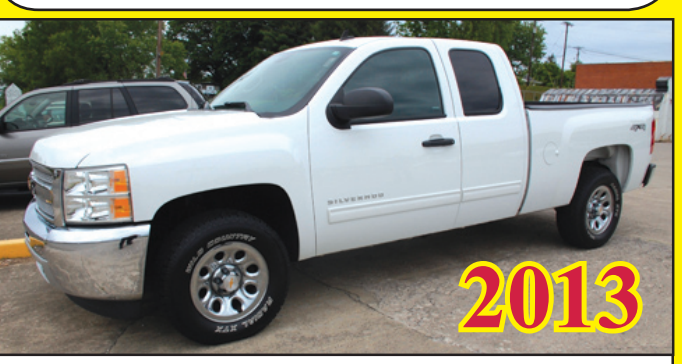
2013 CHEVROLET SILVERADO LT EXTENDED CAB! 4X4 WITH 5.3 ENGINE! 50,000 MILES! NICE CLEAN TRUCK! COME AND SEE!