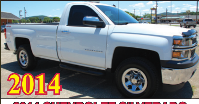
CHEVROLET 4X4, ONE OWNER! ONLY 26,000 MILES! FINANCING AVAILABLE! COME AND SEE!