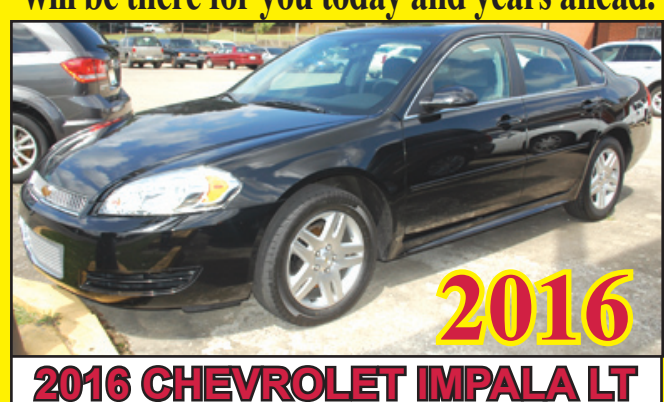
V6 LIMITED EDITION. SHARP FAMILY CAR. STOP BY AND TEST DRIVE FOR YOURSELF!