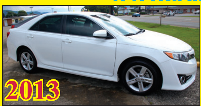
2013 TOYOTA CAMRY SE 4-DOOR, LOADED! ONLY 29,000 MILES! FINANCING AVAILABLE!

Check out our entire inventory at www.buntgrossautosales.com