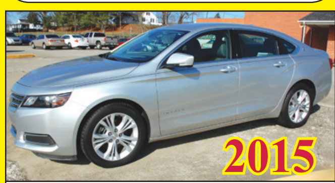
LOADED! ONLY 28,000 MILES! COME & TEST DRIVE! FACTORY WARRANTY! ALL TYPES OF FINANCING!