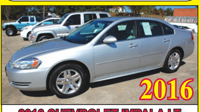
2016 CHEVROLET IMPALA LT 4-DOOR! LIMITED! MOON ROOF! LOADED! LOW MILES! LIKE NEW! FINANCING AVAILABLE!