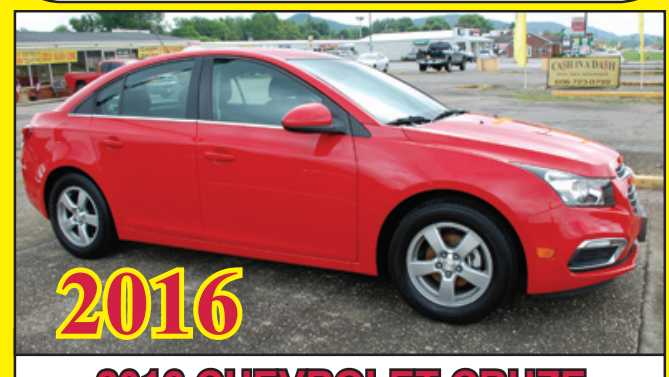
2016 CHEVROLET CRUZE RED & READY! ONLY 23,000 MILES! WELL EQUIPPED! A PERFECT SMALL FAMILY CAR! EXCELLENT GAS!