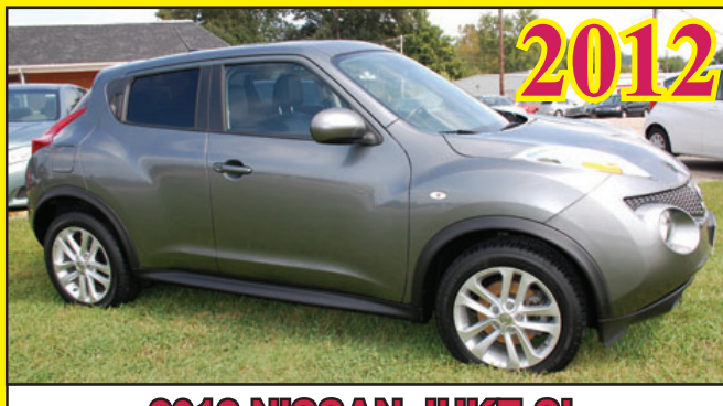
4X4, ONE-OWNER, LEATHER, MOON ROOF! LOADED! LOW MILES! FINANCING AVAILABLE!