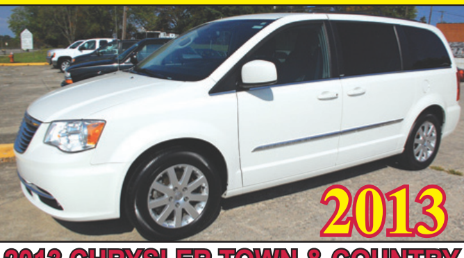
CHRYSLER TOWN & COUNTRY NICE VAN! LEATHER, DVD! LOW MILES!