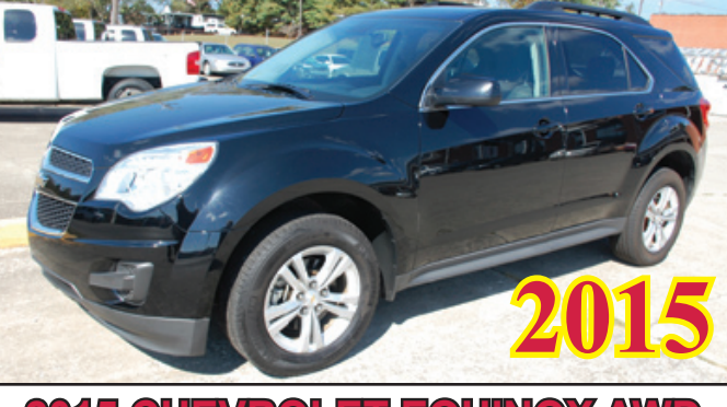
LOADED ALL WHEEL DRIVE! LOW MILES! FACTORY WARRANTY! FINANCING AVAILABLE!