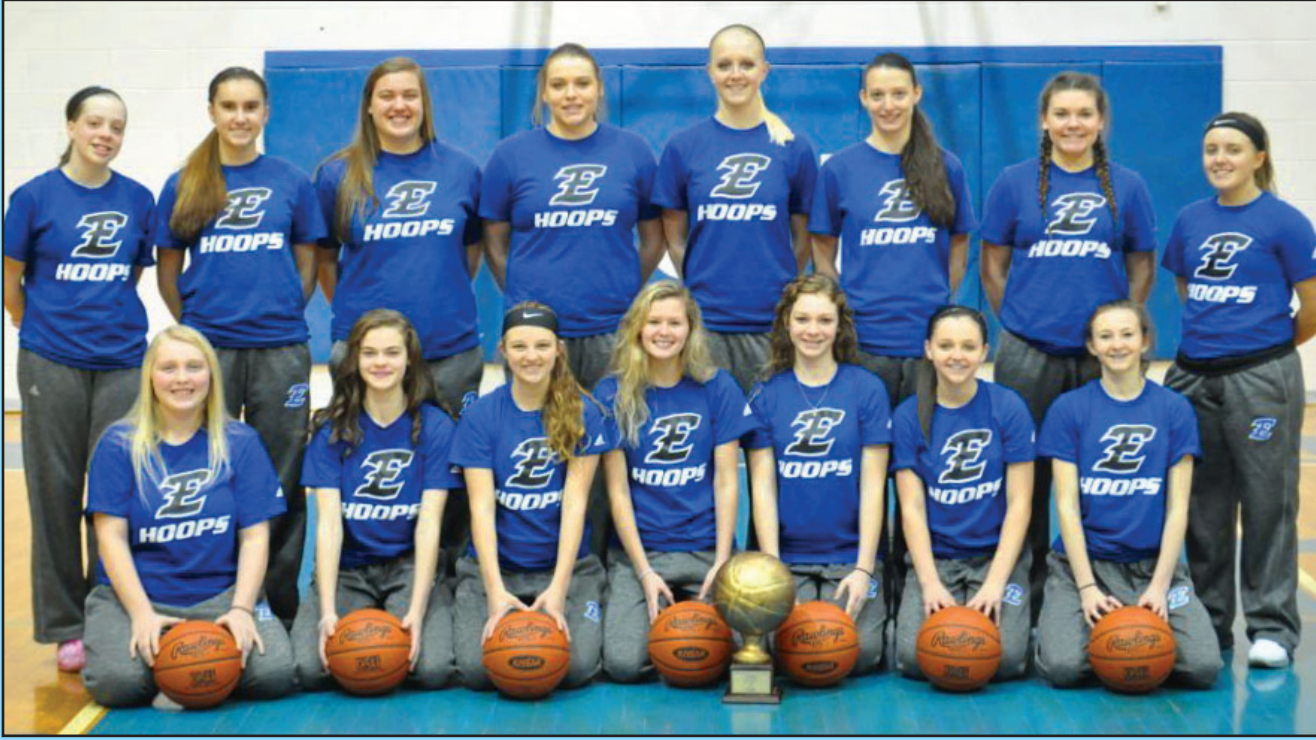
Estill County Lady Engineers