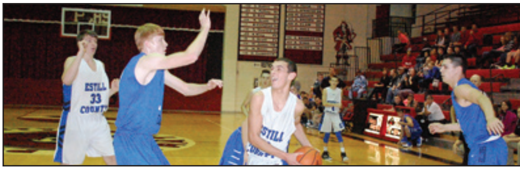
Engineers pick up win over Owsley County, Page 2