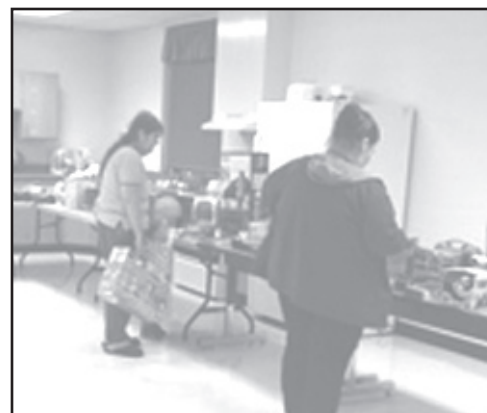
Right Photo: Parents shopping in the store.