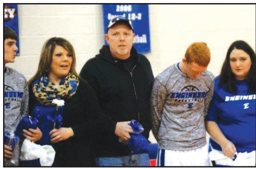
Estill Middle School Engineers 8th Grade Night – Page 13

Tammy Terry's Front Porch Ponderings Page 3